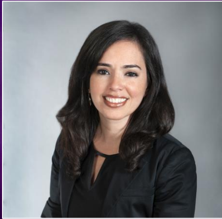
State Senator Cristina Pacione-Zayas D-Chicago