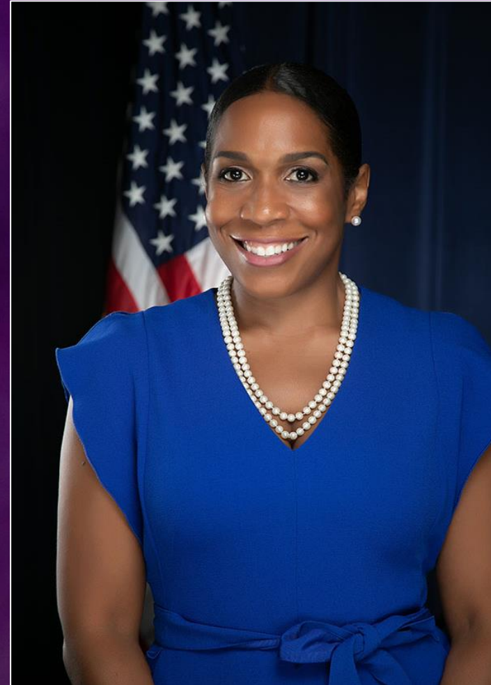
Lieutenant Governor Juliana Stratton